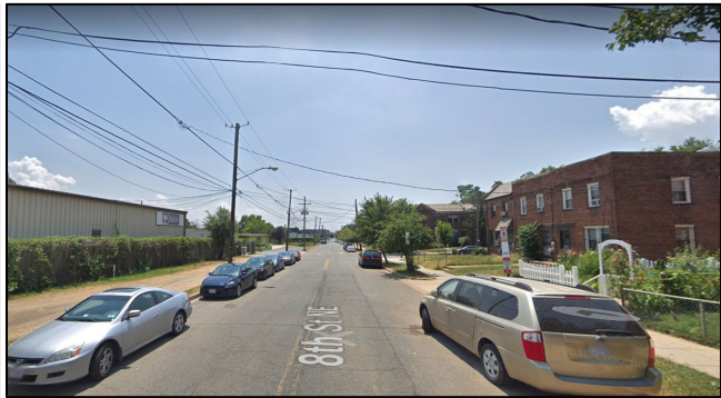
Homes Directly Across the Street from Hannover Site (8 th Street Facing East)