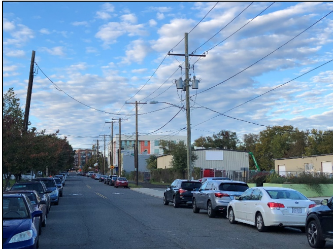
8th Street at Irving Facing North