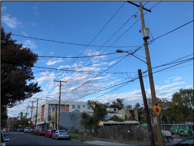
8th Street at Jackson St Facing North