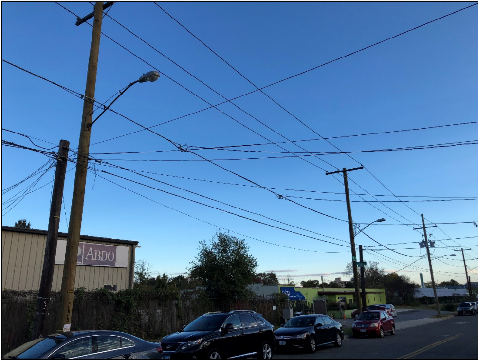
8th Street at Jackson St Facing South