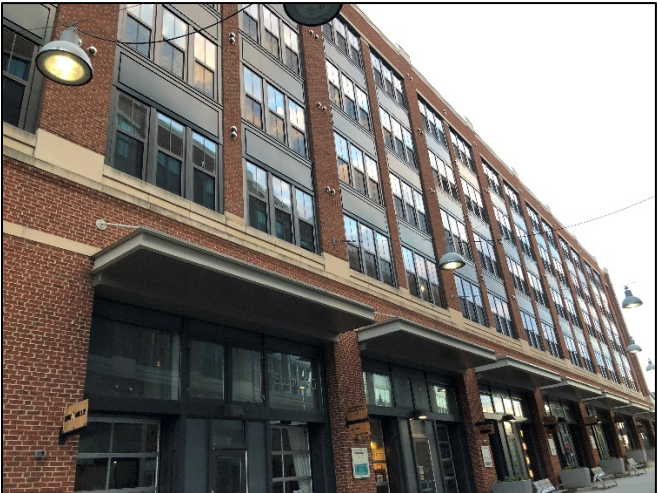
Monroe Street Market (Included in Hannover’s Site Exhibits)