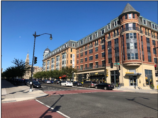
Exhibit II – Recent Nearby Developments